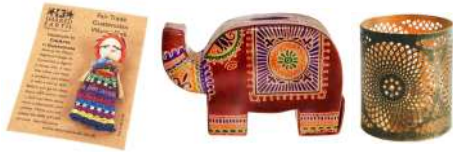
Mayan Worry Doll; Elephant Shape Money Box; Tealight Holder.

Sheree's in the village will be stocking extra fair trade gifts for the Christmas period.